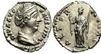
Faustina I, Wife of Antoninus Pius, 138-140

In other circles, a pharisaic Jewish woman veiled herself head to foot whenever she left her home as a symbol of modesty and female subservience. 203 In Middle Assyrian law, a wife claimed the right to wear a veil in public to differentiate her standing from a concubine or slave. 204 Her veil was a sign of prominence and authorized her actions and inheritance as a legal wife. 205