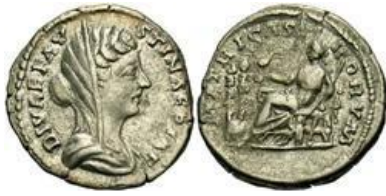
Wife of Hadrian, after 136

Roman women of the first century were “more keen on showing off [their] elaborate hair-style than on constantly wearing an old-fashioned veil.” 201 Ancient coins of aristocracy feature royal women wearing head coverings for a social or fashion statement. 202